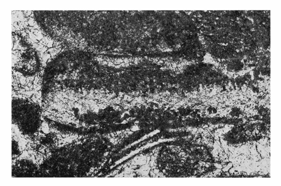
Fig. 1 - Bored molluscan fragment. The short strongly curved tubules along the edge of the shell resemble the ones ascribed by Johnson, H.M. (1966) to G. problematica var. lumbricalis Hoeg. The other intraclasts, illustrated in the same photomicrograph, are completely bored by algal filaments and show a micritic rim. X 75.

1) the grains are bored by algal filaments (also by bacteria); 2) the algal filaments die and decay; 3) the vacated algal tubes are filled by micrite.