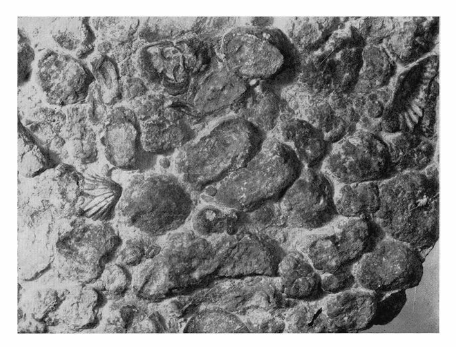
Fig. 1. Bedding surface with coarse fossils accumulated by submarine denudation. – Sphaerocodium limestone. Silurian. Bjersjölagård, Skåne. Nat. size. Photo. 1802.

much more common. It only forms small, often indistinct or wholly hidden hiatuses. How deep a denudation has gone may be difficult to determine, unless remains of the denuded strata have been preserved or a stratigraphical examination makes possible an estimation of the size of the hiatus.