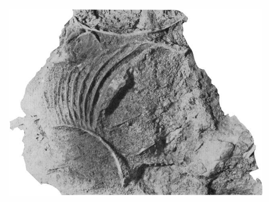
Fig. 5. Grainy corrosion-surface on coquina limestone with cephalopod fragments. – Slite group, Silurian. Klinthagen, Gotland. – Nat. size. Photo. 1804.

in moving water. It has been caused by a lowering of the temperature, reduction of the pH-value, and probably an increase in the CO_2 -content of the water. Corrosion has gone on for a considerable time, during which the corrosion-surface has lain clean-washed. During this time or in connection with a reversal to earlier environmental conditions, the corrosion-surface was invaded by benthogenic organisms, including disciform corals (fig. 6). Afterwards the surface was covered with new material, as a rule of the same nature as in the corroded bed.