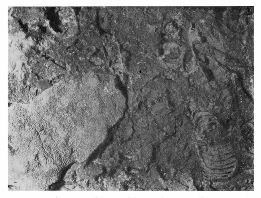
Fig. 6. Compound, massive, tabulate coral ( Favosites ) grown on the corrosion-surface of a fragment limestone. – Slite group. Silurian. Klinthagen, Gotland. – Nat. size. Photo. 1800.

A strictly continuous deposition of sedimentary material can possibly take place for a lengthy period of time in deep sea, never in the shelf area. In the shallow-water areas, where the sedimentation can be directly affected by currents and waves, continual disturbances occur in deposition. These disturbances (mostly in the form of temporary interruptions in deposition, possibly also stirring-up of already sedimented material) may be regarded as a normal phenomenon of sedimentation. Only when the interruptions have comprised a long period of time or when for other reasons they have had more noticeable effects, have we reason to suppose that a hiatus has arisen. With reference to the disturbances in sedimentation discussed above (non-deposition, denudation, and corrosion) we can summarise the occurrence and origin of more or less hidden hiatuses as follows: