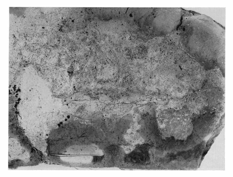
Fig. 3. Vertical section of limestone bed with strongly disturbed colour bands grey, green, yellow, and red). The sediment was unconsolidated when the submarine sliding took place. – Planilimbata limestone. Lower Ordovician. Borghamn, Östergötland. – Nat. size. Photo. 1808.

We may ask whether corrosion takes place in unconsolidated as well as in firm layers. Dissolution of the carbonate occurs when the water is not saturated with CaCO_3 and particularly if there is a surplus of CO_2 , which may occur also when unconsolidated calcareous mud covers the seafloor. In fact the soft mud should be more readily dissolved than the firm beds. A direct proof of corrosion's occurring in unconsolidated layers is found here and there in strongly disturbed, distinctly slid mud layers, with colourbanded corrosion zones (fig. 3).