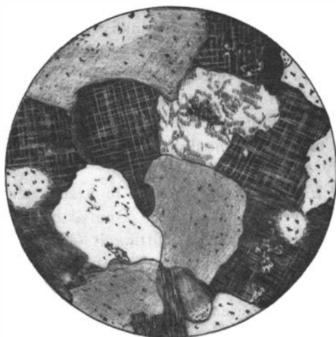
Fig. 4. Microcline (cross-hatched) forcing its way along the boundary between two quartz grains.

Protuberances of microcline are often seen to penetrate into quartz grains (fig. 3) or to force their way along the grain boundaries (fig. 4). Microcline was in no case observed as inclusion in quartz, whereas small rounded quartz grains are almost everywhere present as inclusions in microcline. Sometimes several such rounded quartz inclusions may show exactly the same optical orientation mutually or even as compared with an adjacent quartz grain outside of the embedding microcline individual. In some cases these inclusions do not consist of isolated quartz grains but of quite an aggregate of interlocking grains, exactly similar to those of the mosaic portions just referred to. The boundary between these quartz grains