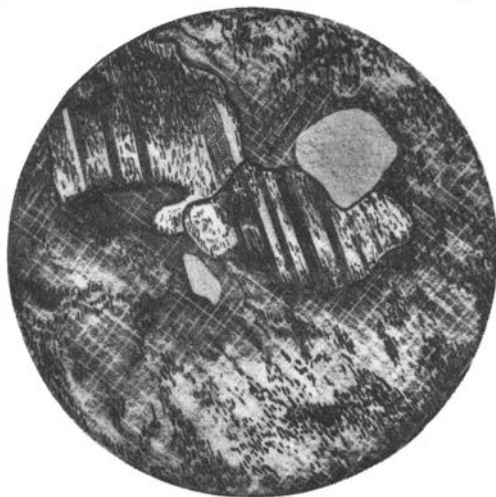
Fig. 5. Inclusions of albite (striped) in microcline.

In this vein the interrelations between albite and microcline are more clearly revealed. As was already mentioned the central parts of the vein contain only subordinate amounts of albite and it seems perfectly clear that a replacement by microcline has taken place. Thus irregular albite