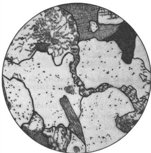
Fig. 3. Microcline penetrating into one quartz grain and afterwards following the boundary between that grain and another.

In order to get at an explanation of the phenomena briefly delineated above, a number of slides from different interesting portions of the boulder were examined, and an account of the results is given below.