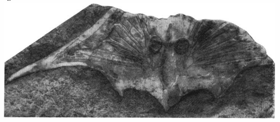
Fig. 1. Bennevias pis longicornis n. sp. Fragmentary cephalic shield, in dorsal view. The exoskeleton largely removed, so that several internal canals can be seen. Holotype. × 4 diam.

Material. — This species is based on the holotype alone, which consists of a fragmentary cephalic shield, lacking the rostral area and the right cornu.